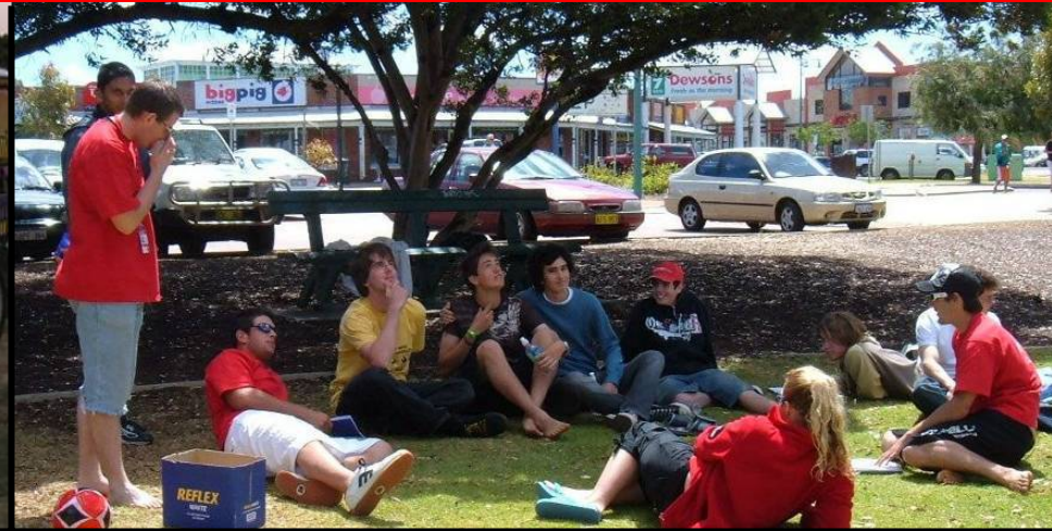
WA AIDS Council Keep it Safe Summer