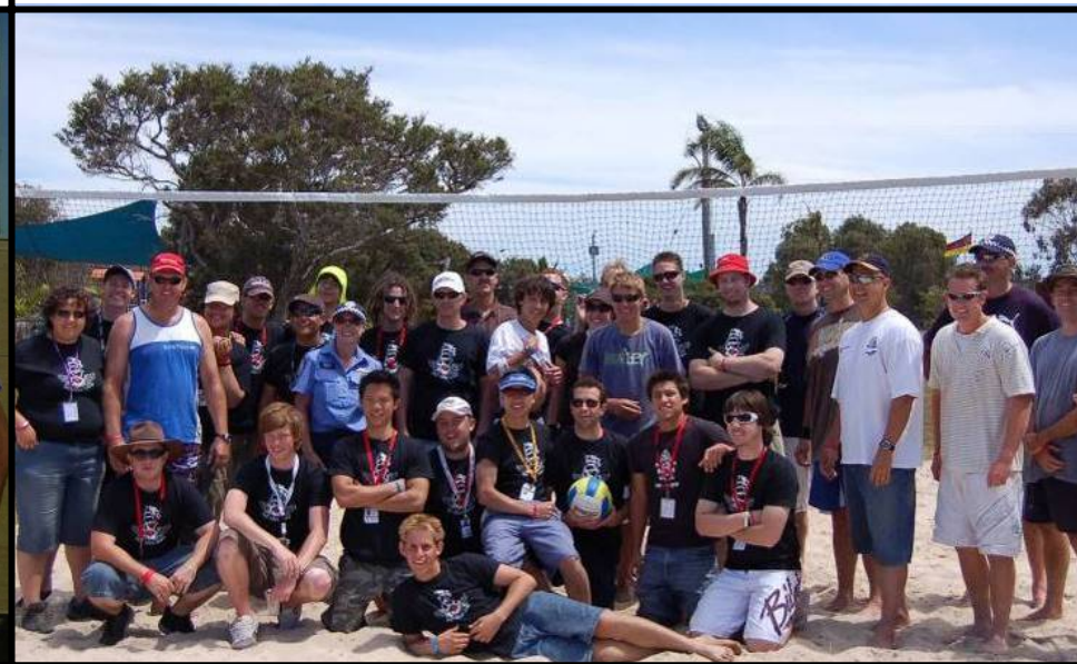
Leavers Chaplains The Red Frog Crew