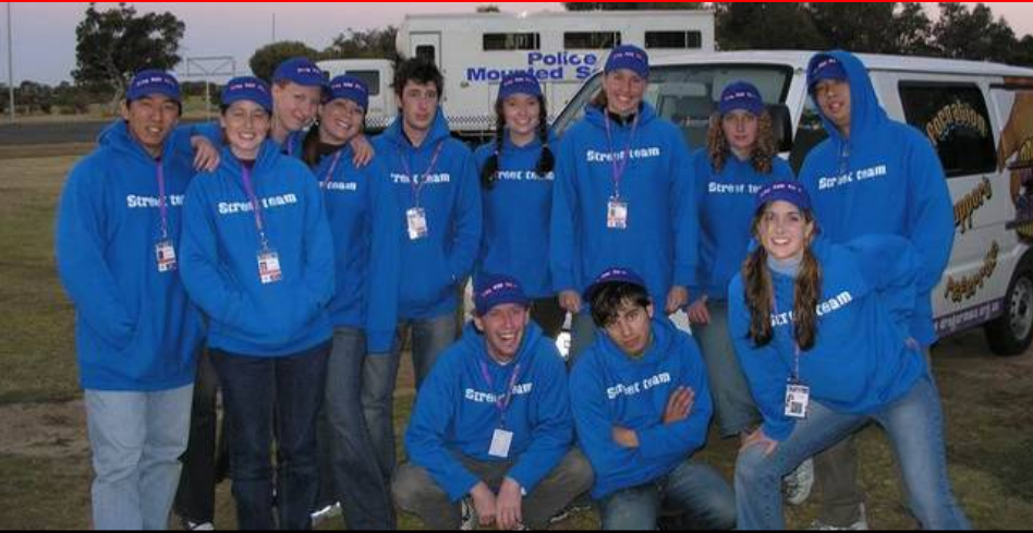
Drug ARM WA Street Patrol and Recovery Tents