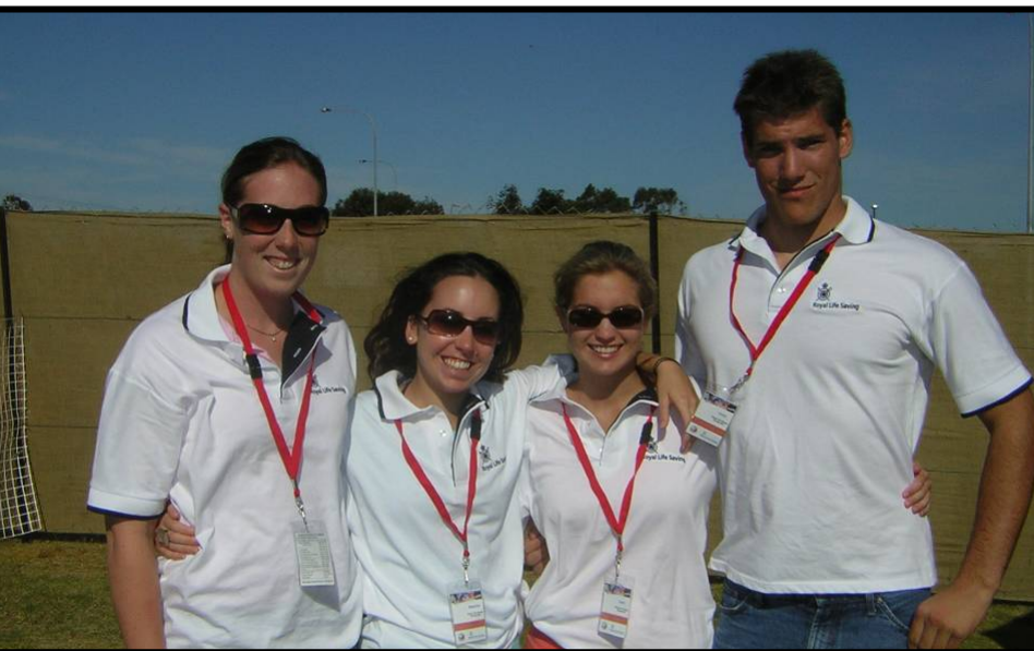
Royal Life Saving Society of WA Don't Drink and Drown