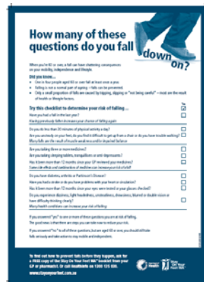
Falls risk checklist HP 2857