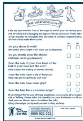
Shoe safety checklist HP 7939