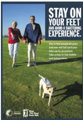
Information booklet HP 2570

Stay On Your Feet WA® has a range of resources designed for the community setting including: