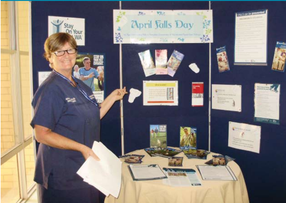
ABOVE: April No Falls Day 2010 at Canarvon Hospital